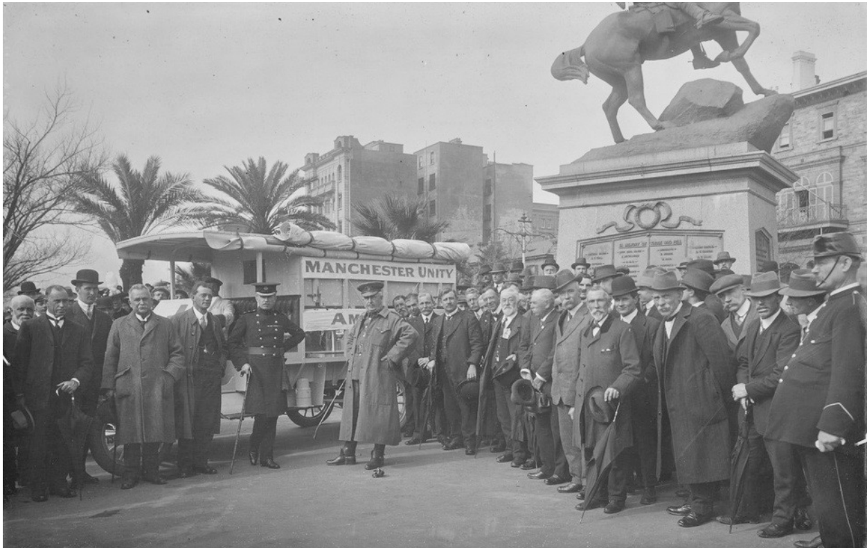
Above: The first Duncan & Fraser ambulance for The Manchester Unity Independent Order of Oddfellows was presented to the military authorities by the South Australian Governor, Sir Henry Galway, on 2 August 1915 at the Soldiers' Memorial Statue on North Terrace. Sir Henry is centre left with the walking stick.

Duncan & Fraser also built ambulances for The Manchester Unity Independent Order of Oddfellows. The first was presented to the military authorities by the South Australian Governor, Sir Henry Galway, on 2 August 1915 at the Soldiers' Memorial Statue on North Terrace. The ambulance, which cost £324, had attached to its side a brass plate bearing the inscription "Presented by the Manchester Unity Oddfellows, South Australia, 2 nd August, 1915." The second was presented on 29 October 1915 with a similar brass plaque.