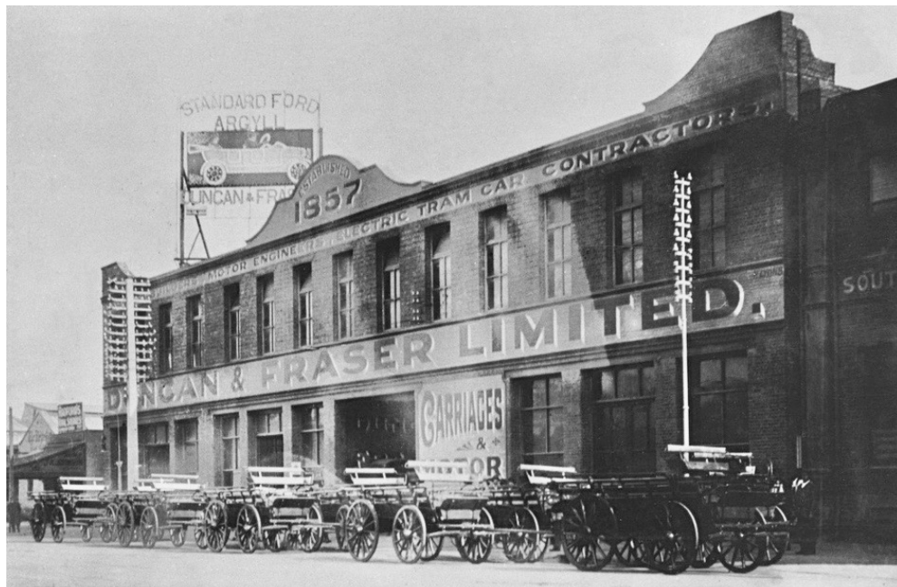
Above: Horse-drawn vehicles worked alongside motorised vehicles in World War I. Duncan & Fraser built these general service wagons for the Australian Army in 1915. [Wikimedia Commons]