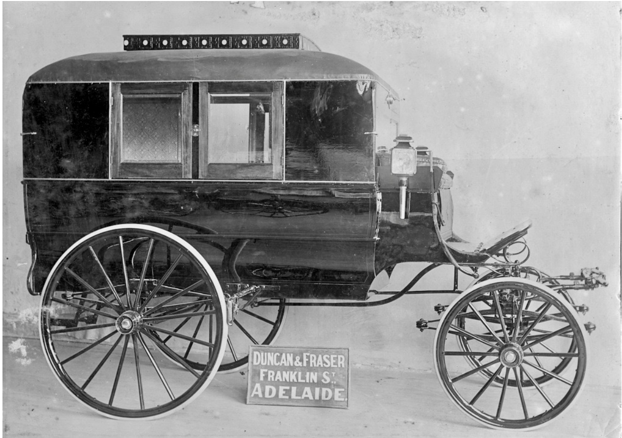
Above: The catalogue photograph of Duncan & Fraser's horse-drawn ambulance around 1904 featuring rubber tyres on the wheels.

Prior to the war civilian ambulances were typically funded by public subscriptions. This approach continued with the wave of patriotism that swept the British Empire when motor ambulances were donated by individuals, groups and organisations.