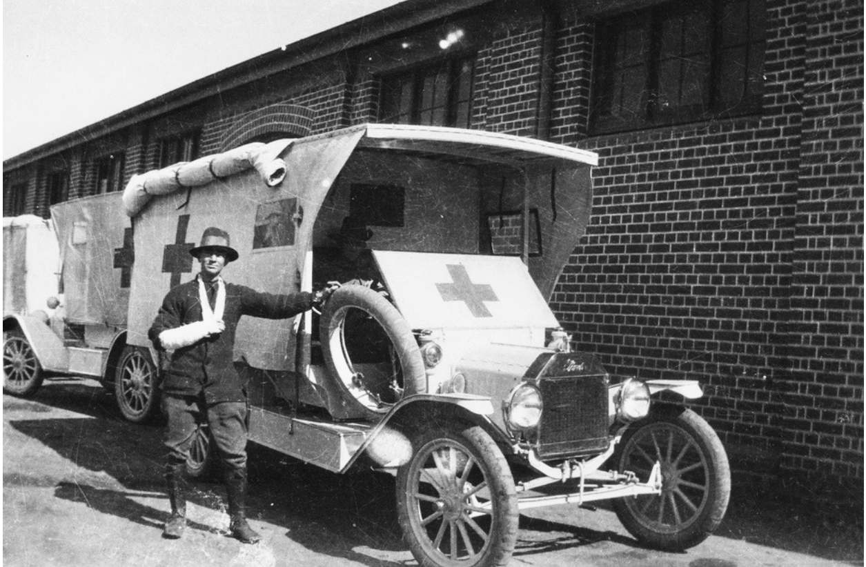
Above: One of the Duncan & Fraser ambulances donated by the Clare and District Motor Ambulance Fund. Pictured here at the Keswick Barracks, South Australia, prior to it being shipped to the western front.